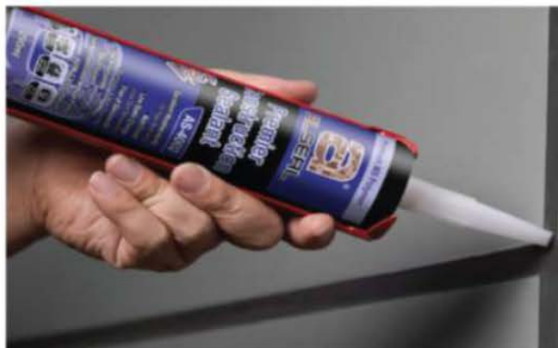
Aluminium Composite Panel Façade