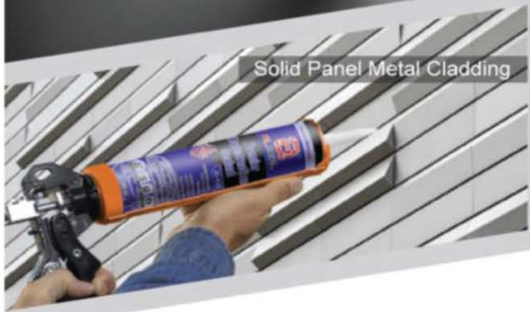
Solid Panel Metal Cladding