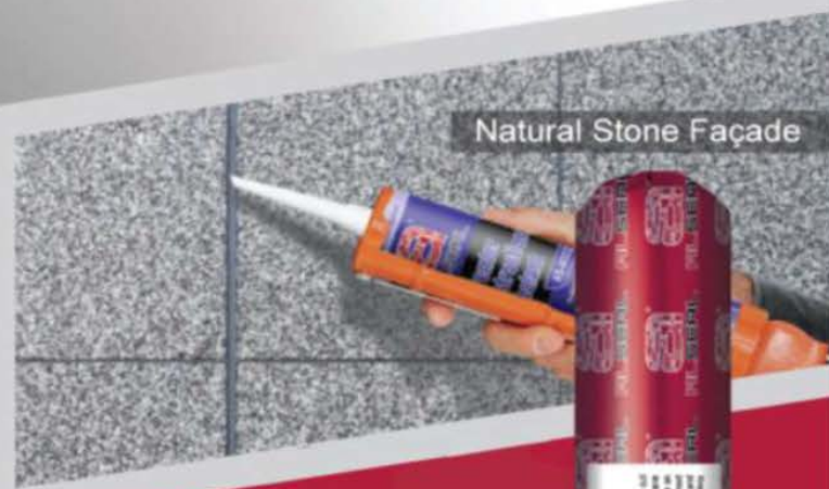
Natural Stone Façade